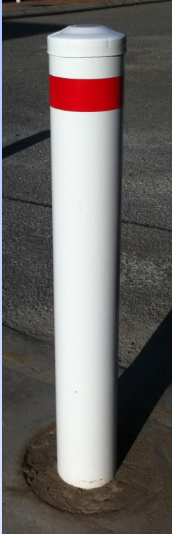
OPTIONAL White Powdercoat

In-Ground Permanent bollards are used in applications where there is a requirement for higher strength and impact resistance for the bollard installation, in addition to applications where there is no existing concrete slab or footing to attach a surface mount bollard to.