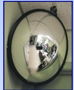
Indoor convex mirrors are ideal to enhance safety and site security anywhere vision is impaired by blind corners or obstacles.