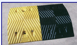
Rubber speed humps —offer smooth, silent operation where traffic flows are not excessive.