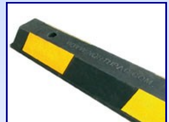
Wheel stops —available in either high impact-resistant plastic or rubber designs.