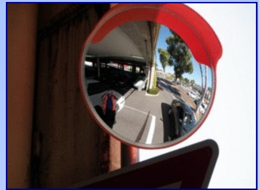
Outdoor convex mirrors improve safety in commercial and industrial car parks.