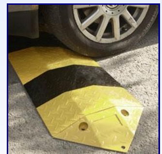
Steel speed humps —suitable for high traffic flows