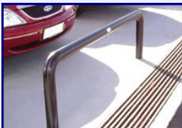
U-hoops —enhance perimeter security and protect pedestrians from vehicular traffic.